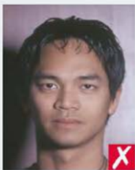
shadows behind head