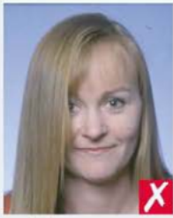
hair across eyes