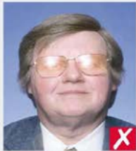
flash reflection on lenses