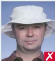
wearing a hat