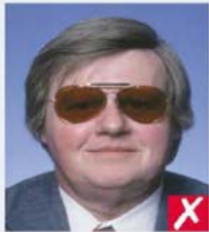
dark tinted lenses