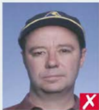
wearing a cap