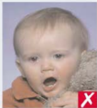
mouth open and toy too close to face