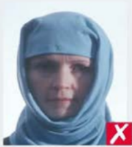
shadows across face