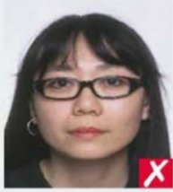
frames too heavy