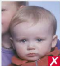
shows another person