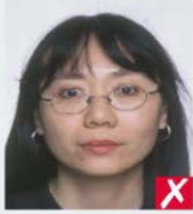
frames covering eyes