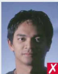
shadows across face